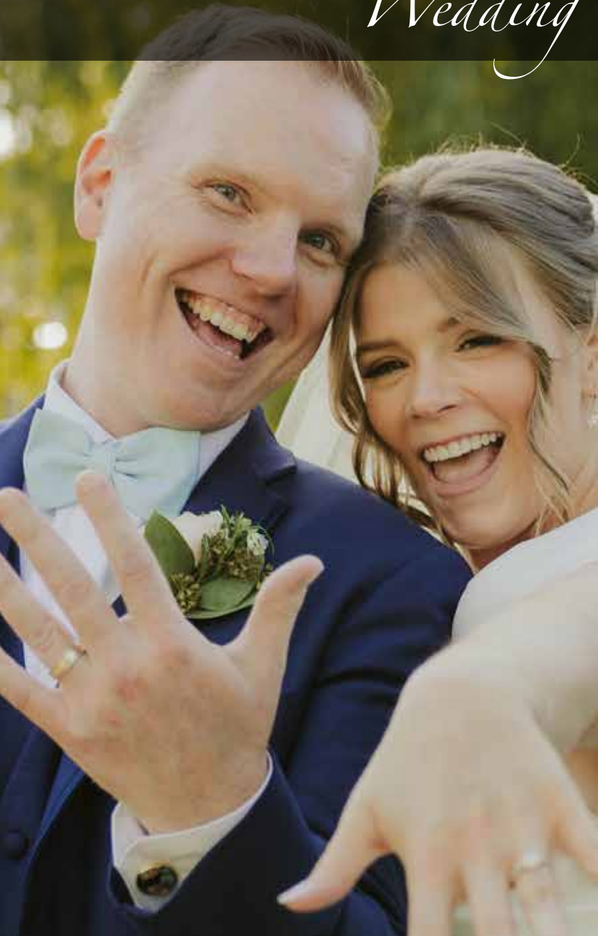
Breathtaking On-Site Ceremonies