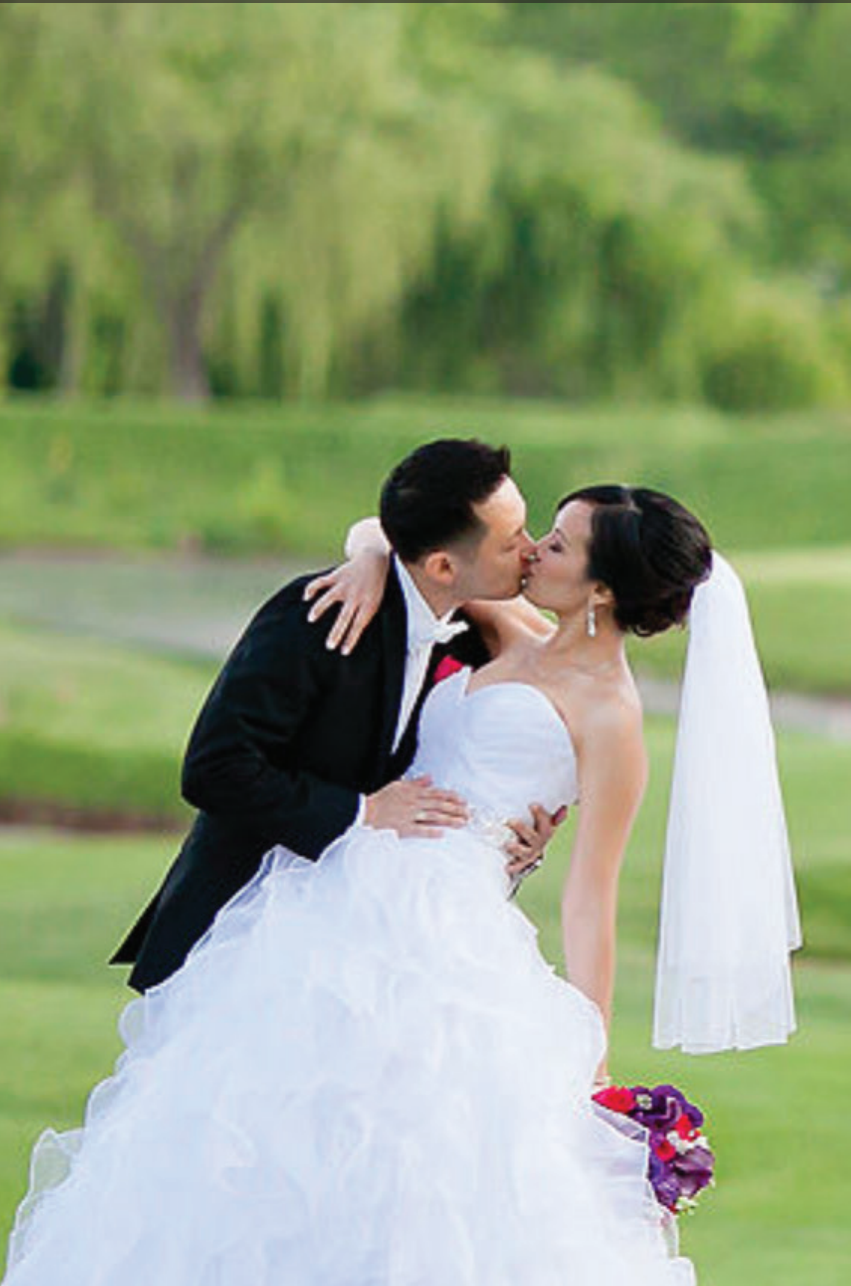
Breathtaking On-Site Ceremonies