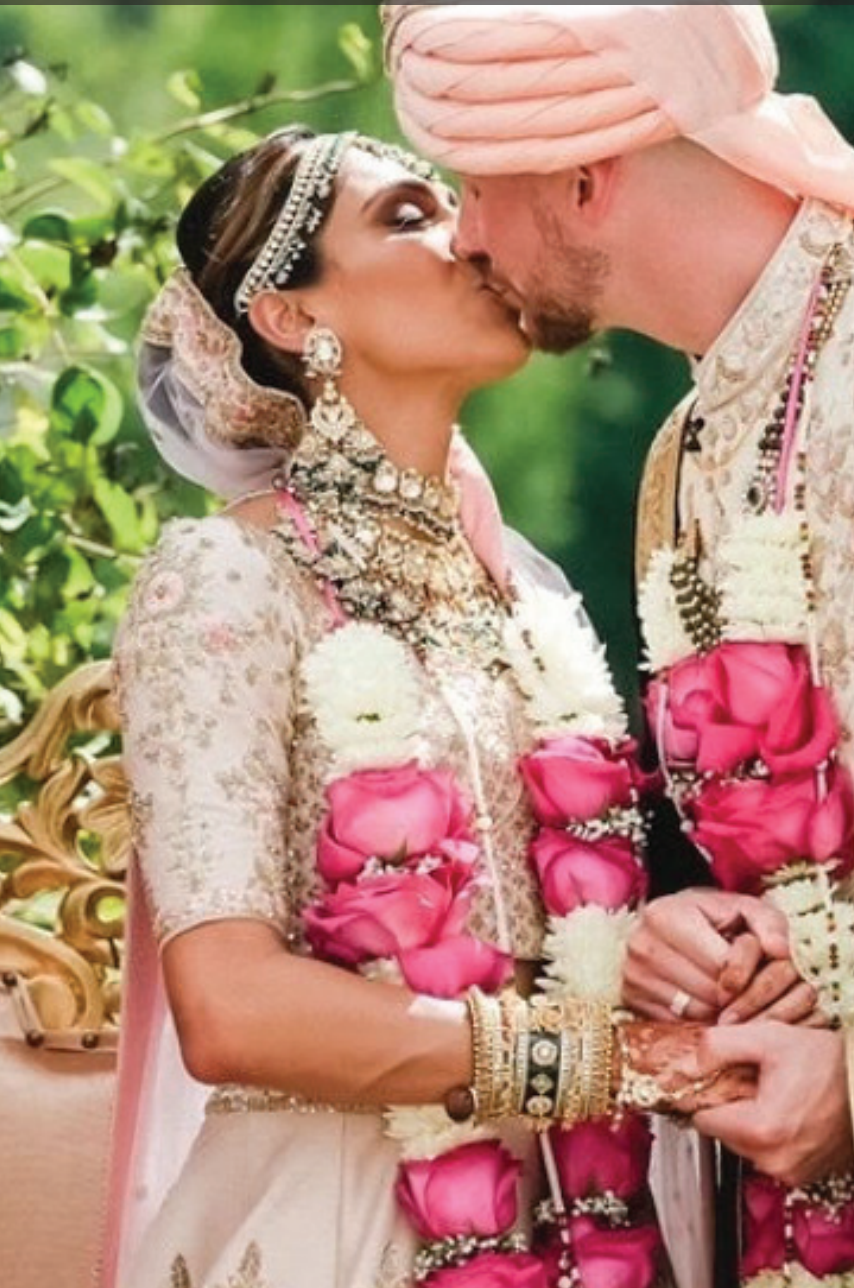
Breathtaking On-Site Ceremonies