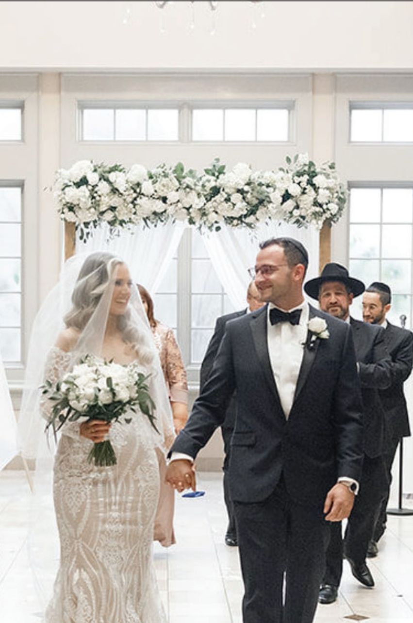
Breathtaking On-Site Ceremonies